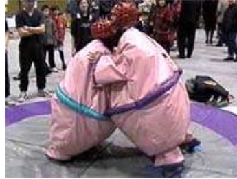
Soft Play Area