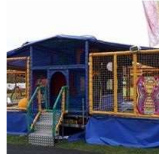
Soft Play Area